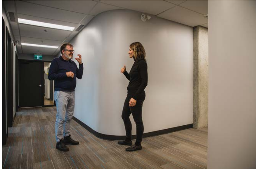
Along with curved corners the corridors are wider to accommodate wheelchairs and sign language users as they travel through the hallways